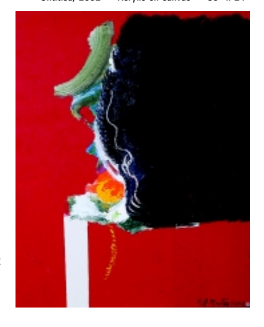
Untitled, 2002 Acrylic on canvas 30" x 24"

For more information, Eugene Martin's website can be accessed at: http://morayeel.louisiana.edu/ejMARTIN/ejMARTIN-artist.html