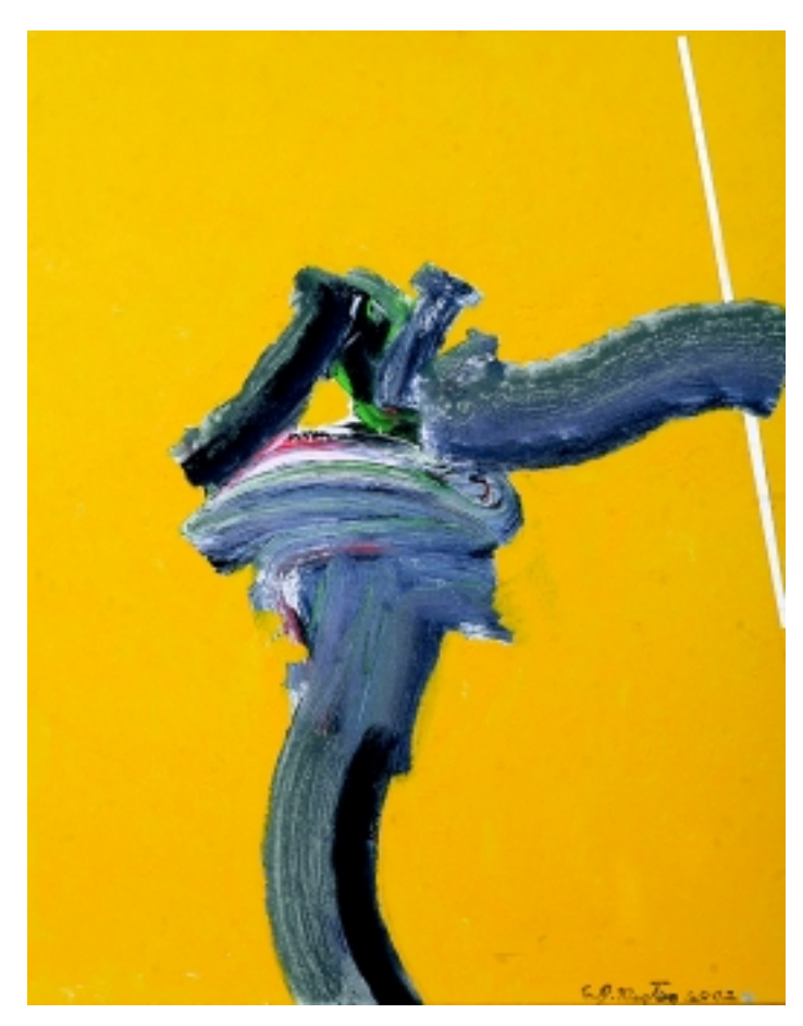
Untitled, 2002 Acrylic on canvas 30" x 24"