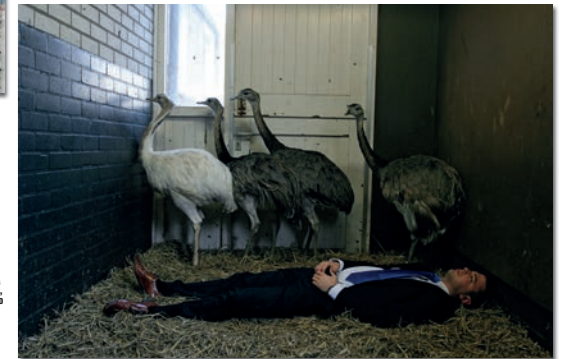
▶ Melanie Bonajo's "Animals," 2012, at ANUCC, Volta10