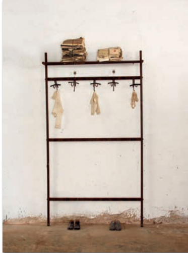
◀ Christian Fiqueras's "Howard Sisters," 2013, at Montoro 12 Contemporary Art, The Solo Project